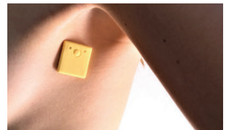
3. Data collection