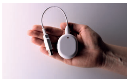
5. Recharge for 2 hrs