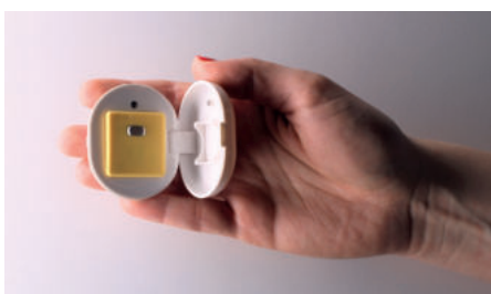
4. Insert into the charging case